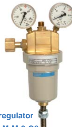
Manifold pressure regulator U13 M-200-20-M24f-M-M-0-O2