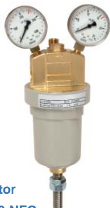
Line pressure regulator U13 P-200-16-0-M-M-0-NFG